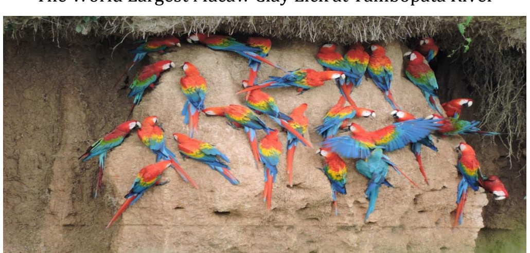
The World Largest Macaw Clay Lick at Tambopata River

White Bellied Parrot, Opal Rumped Tanager, Paradise Jacamar, Grayish Mourner, White Throated Antbird, rufous tailed Foliage Gleaner.