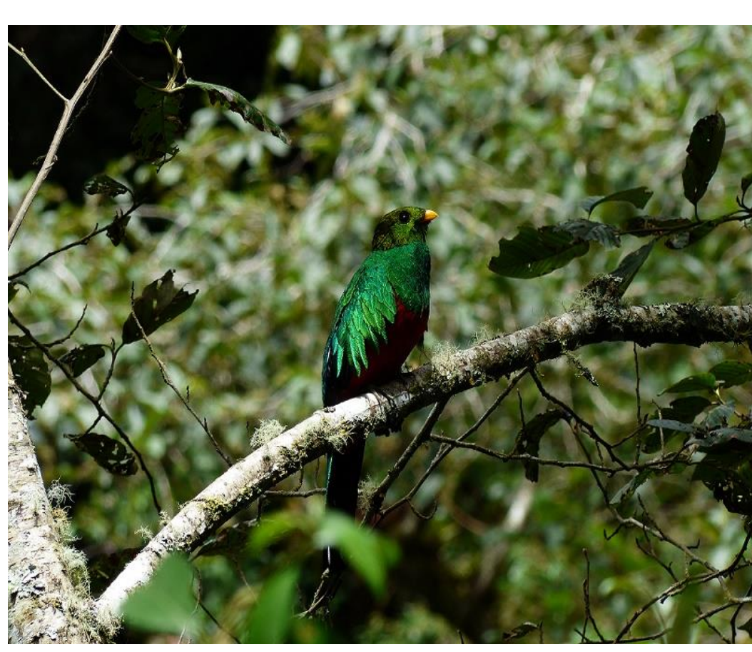
Golden Headed Quetzal – Target Bird of Manu Road

Golden Headed Quetzal, Handsome Flycatcher, Common Chlorospingus, Greenish Puffleg, Black and Chesnut Eagle, Smoke Colored Pewee, Beryl Spangled Tanager, Saffron Crowned Tanager, Orange Bellied Euphonia, Bronzy Inca, Blue and White Swallow & Rusty Winged Barbtail.